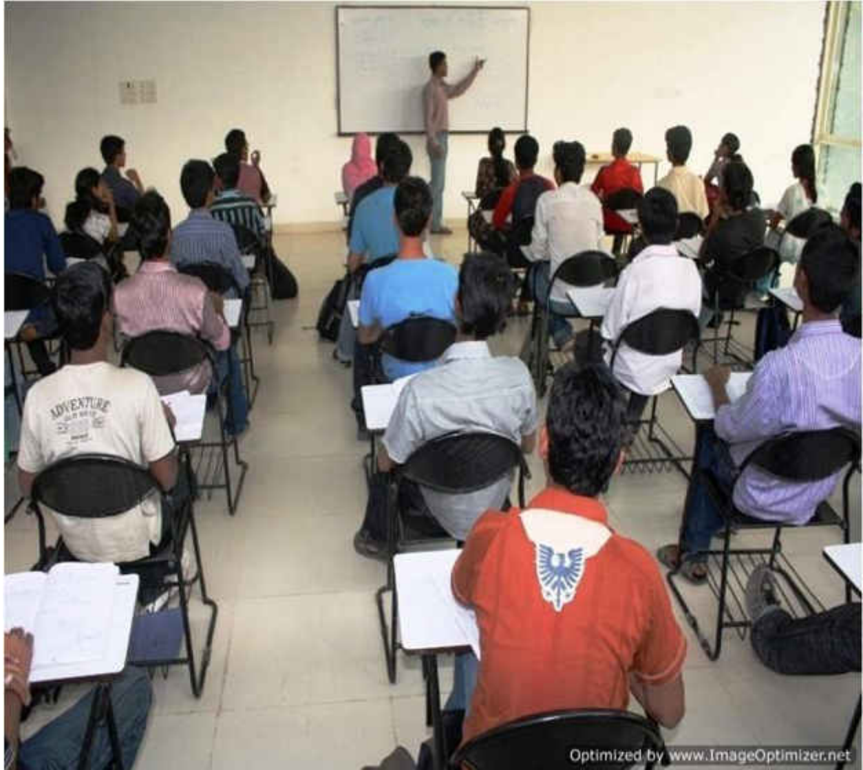
ISB&M SCHOOL OF TECHNOLOGY TUTORIAL ROOM