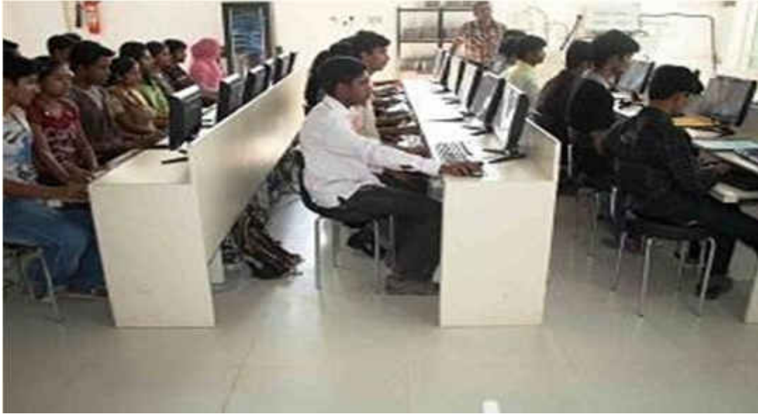
ISB&M SCHOOL OF TECHNOLOGY COMPUTER LABORATORY