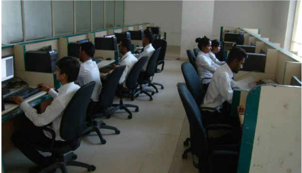
ISB&M SCHOOL OF TECHNOLOGY COMPUTER LABORATORY