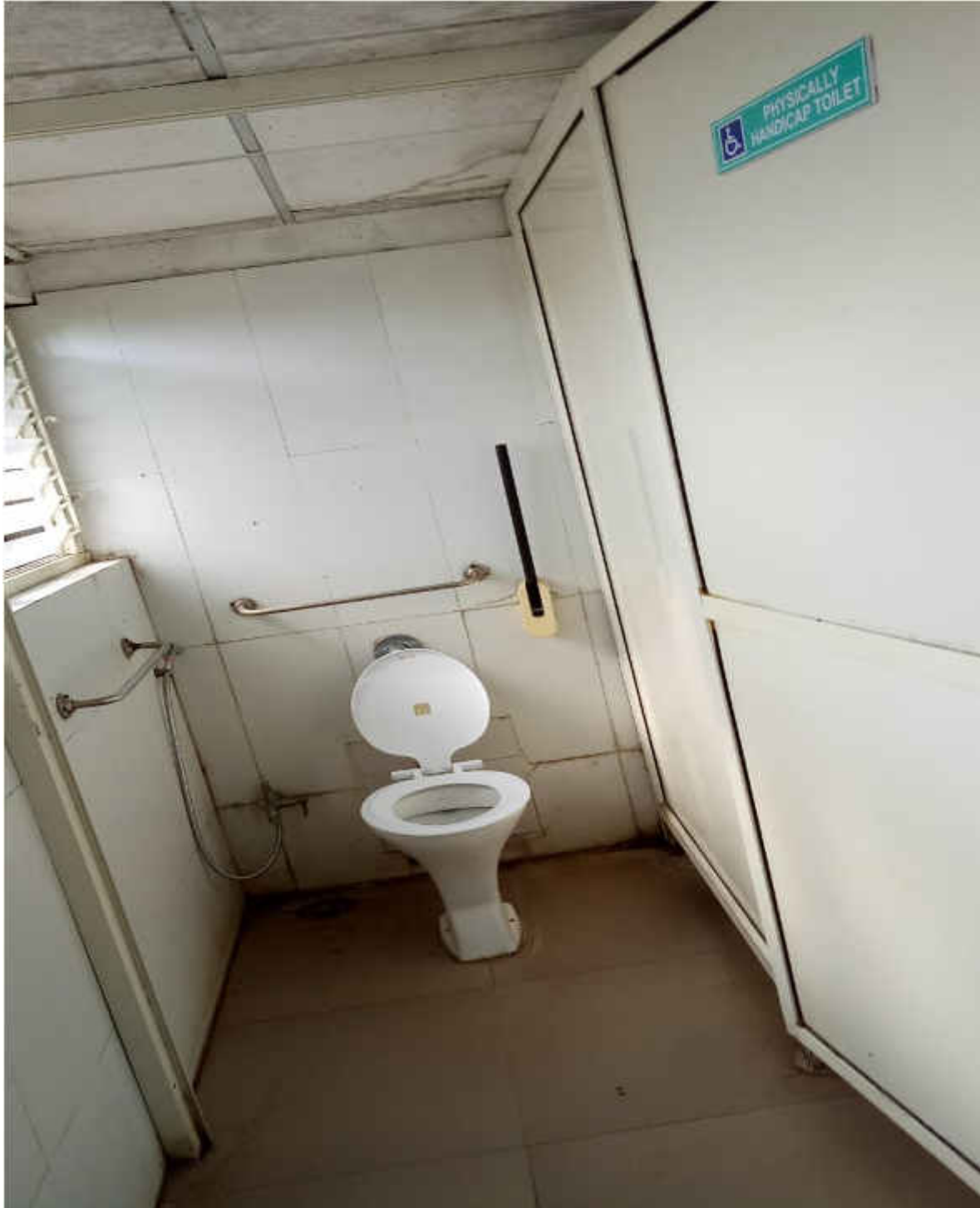
BOYS TOILET FOR PHYSICAL HANDICAP PEOPLES