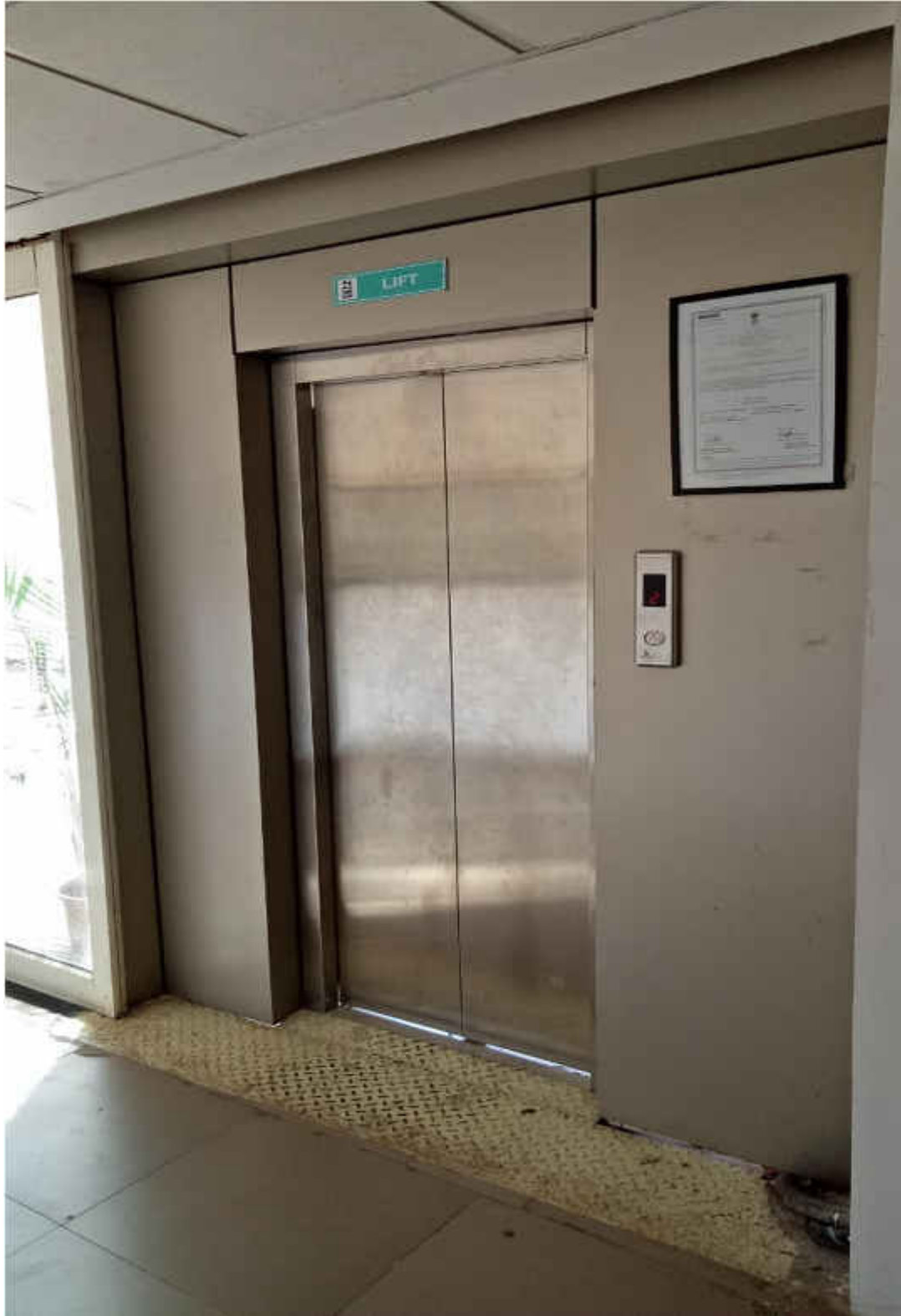
ISB&M SCHOOL OF TECHNOLOGY LIFT