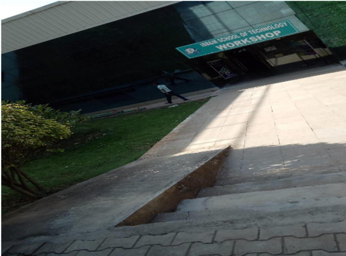
ISB&M SCHOOL OF TECHNOLOGY WORKSHOP