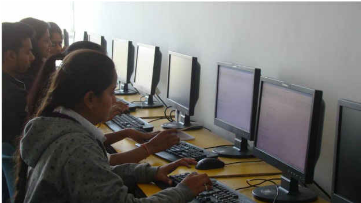
ISB&M SCHOOL OF TECHNOLOGY COMPUTER LABORATORY