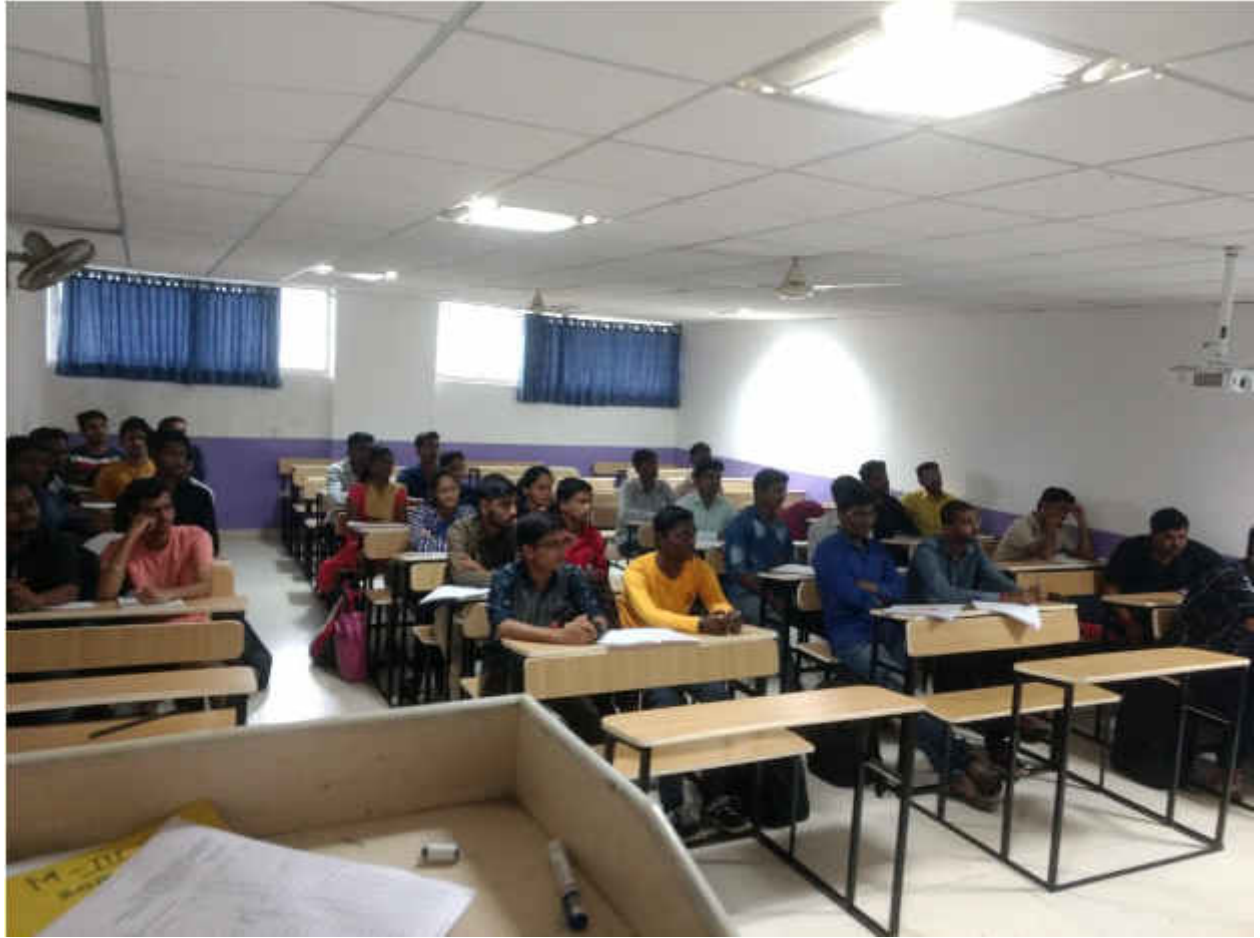
ISB&M SCHOOL OF TECHNOLOGY FIRST YEAR ENGINEERING CLASSROOMS-GROUND FLOOR