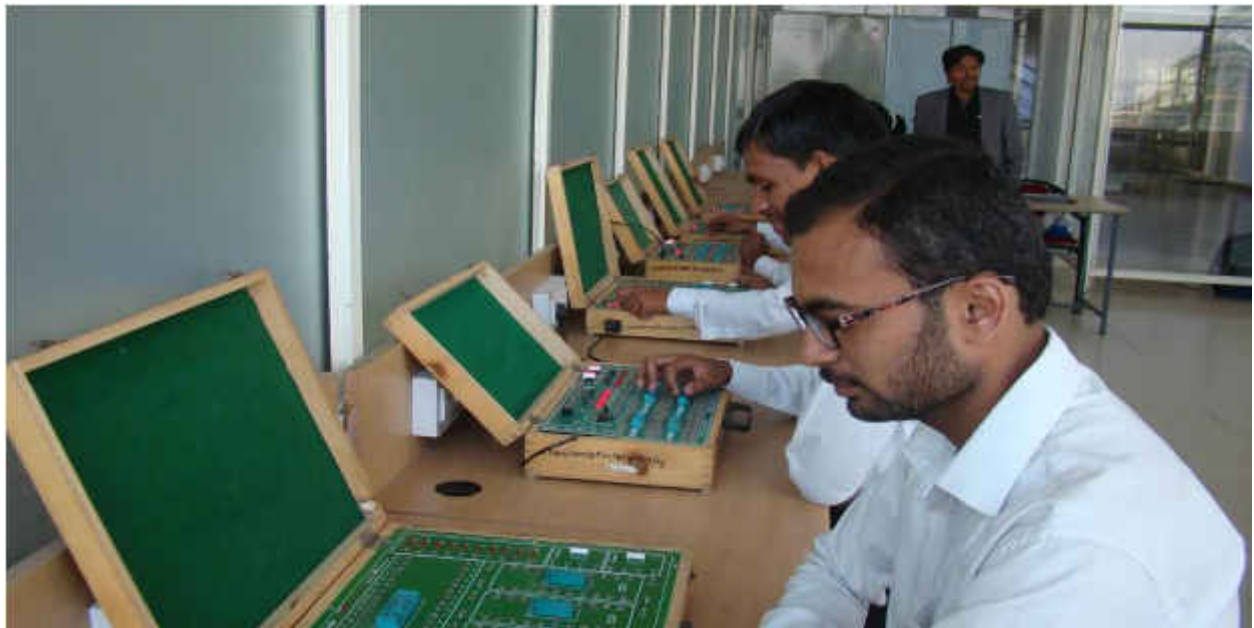
ISB&M SCHOOL OF TECHNOLOGY COMMUNICATION LABORATORY