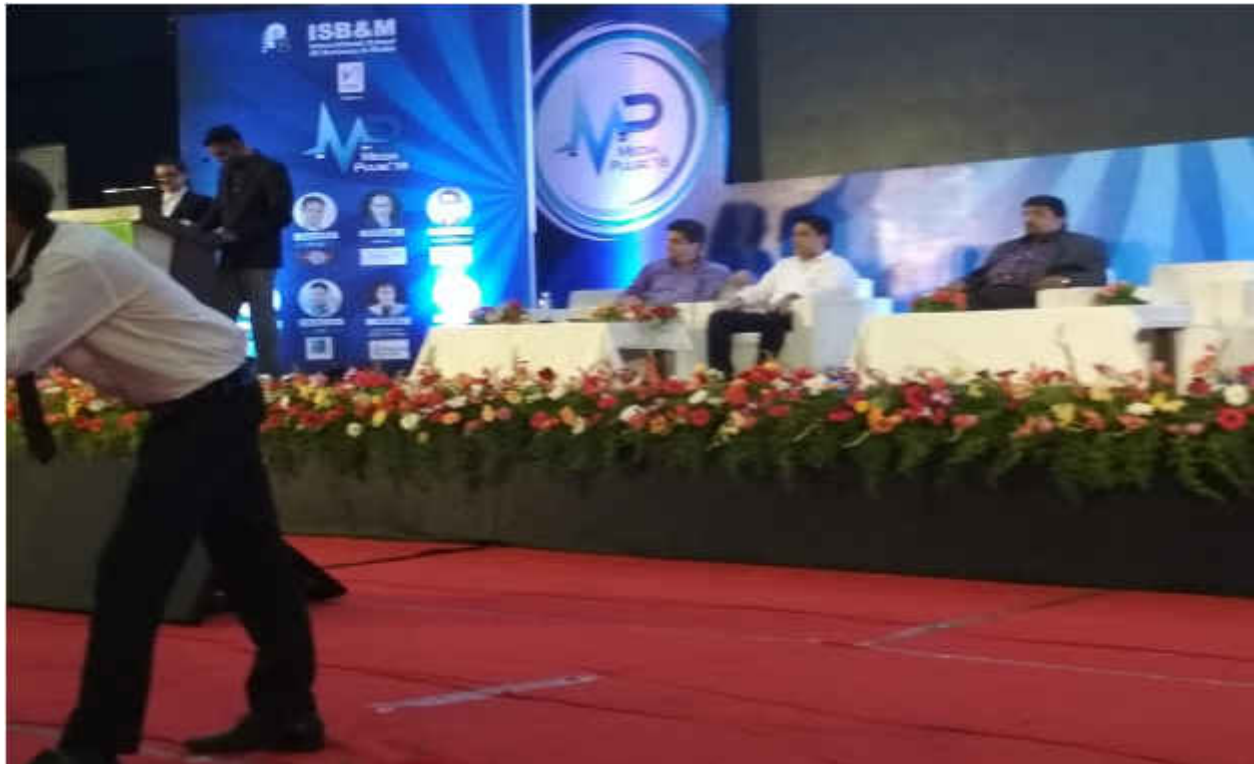
ISB&M SCHOOL OF TECHNOLOGY –AUDITORIUM