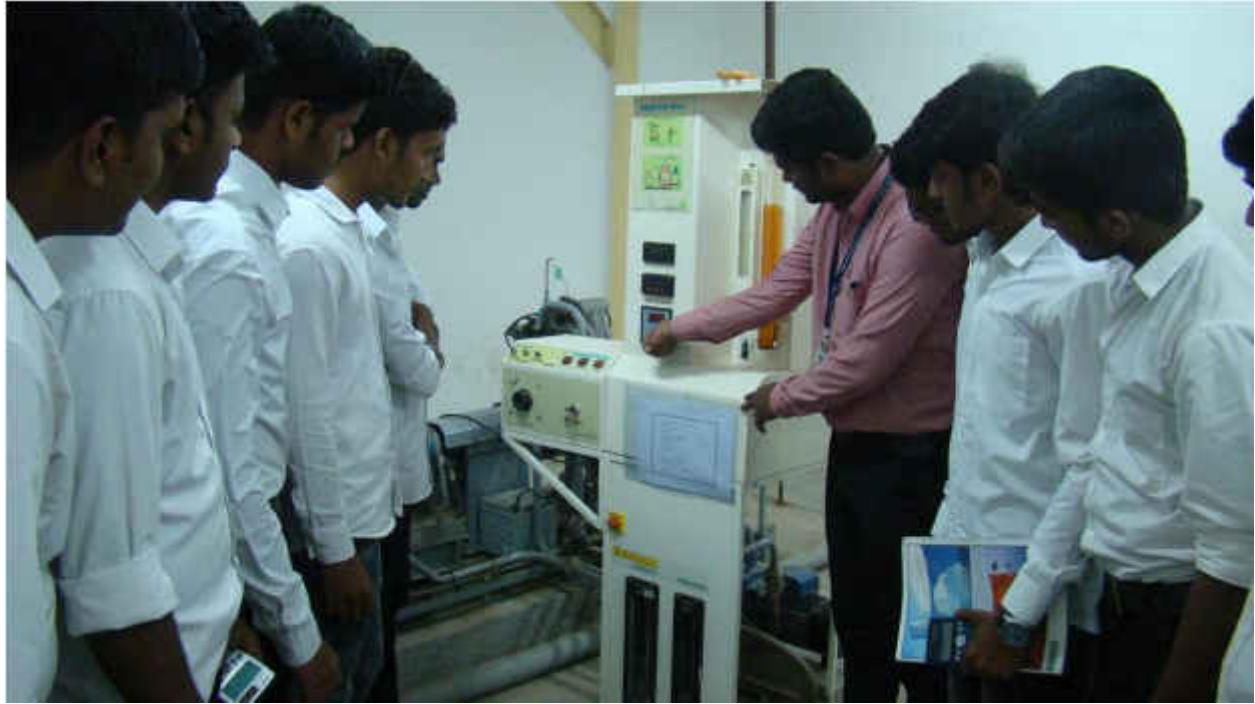
ISB&M SCHOOL OF TECHNOLOGY ICE ENGINE LABORATORY