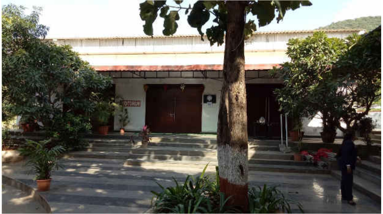
ISB&M SCHOOL OF TECHNOLOGY –AUDITORIUM