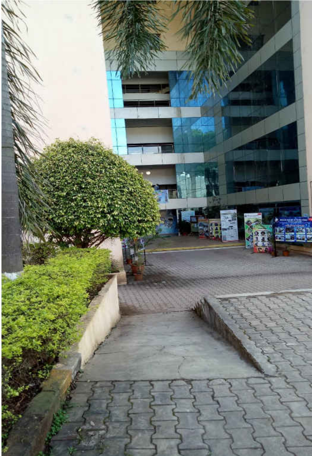
RAMP ENTRANCE TOWARDS COLLEGE