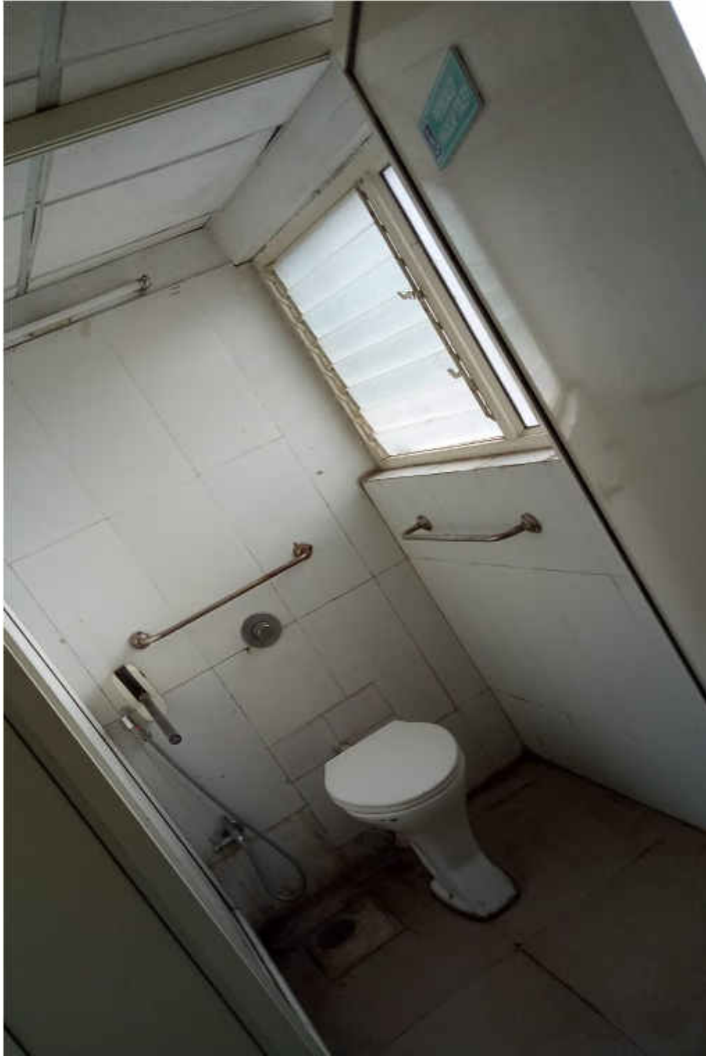
GIRLS TOILET FOR PHYSICAL HANDICAP PEOPLES