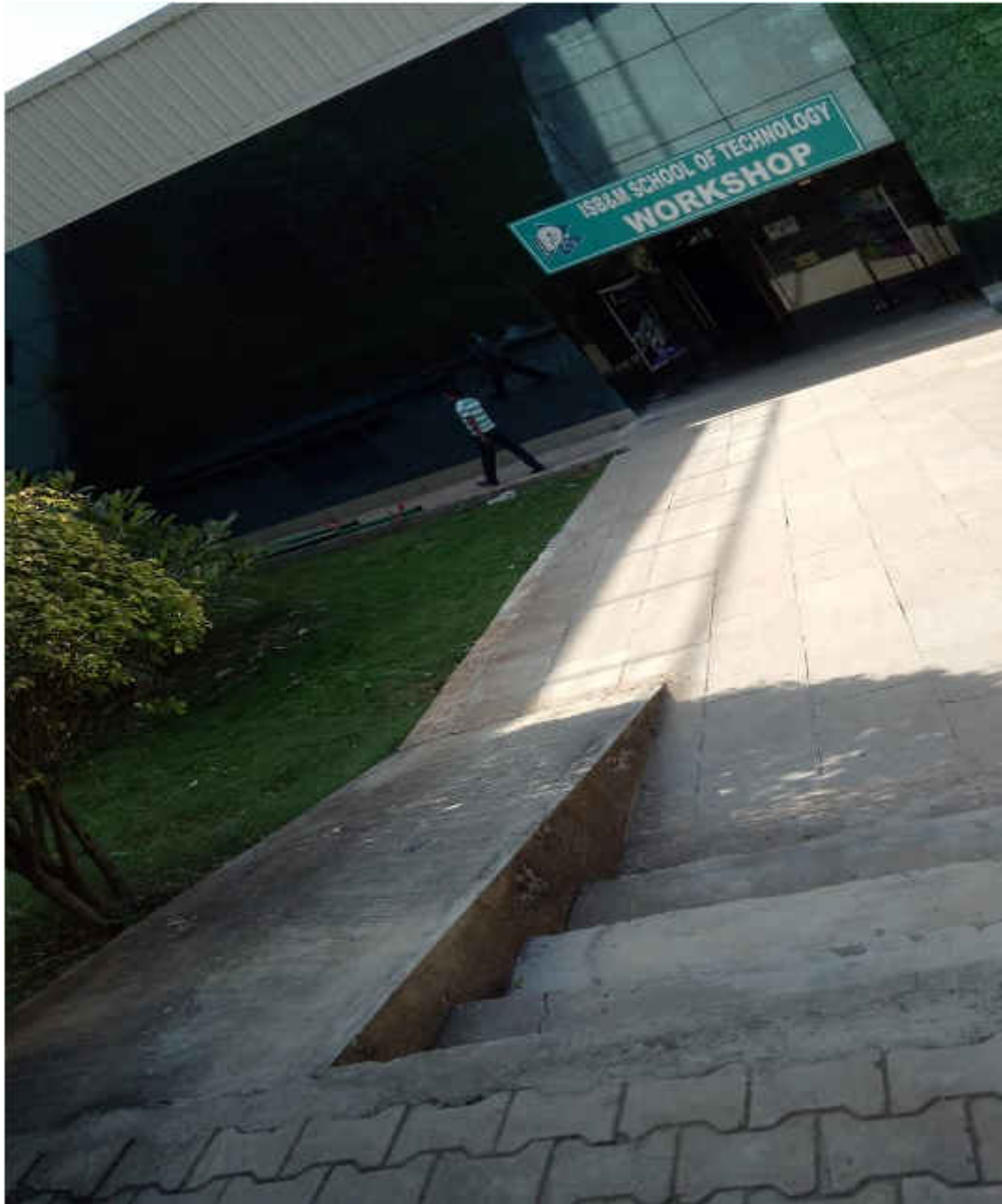
RAMP FOR TOWARDS WORKSHOP