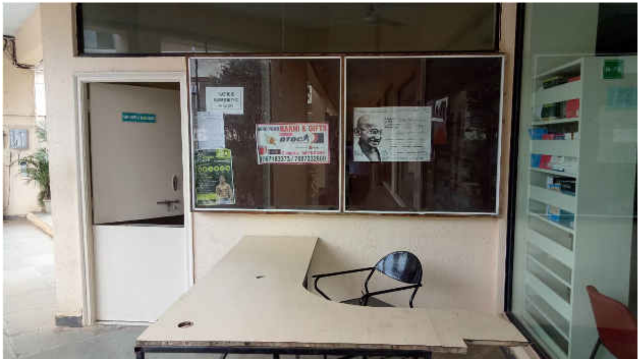
ISB&M SCHOOL OF TECHNOLOGY XEROX FACILITY